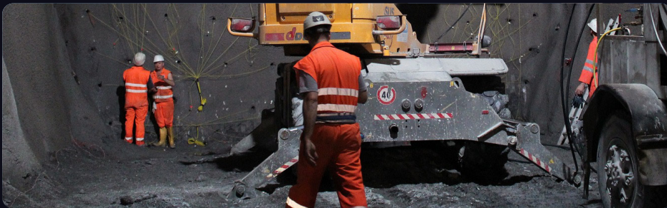
Construction Site Personnel Management