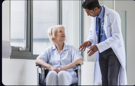
Nursing Home Personnel Management