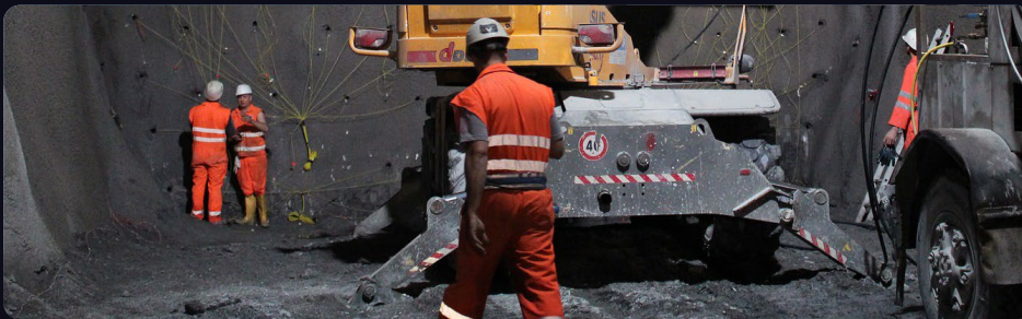
Construction Site Personnel Management