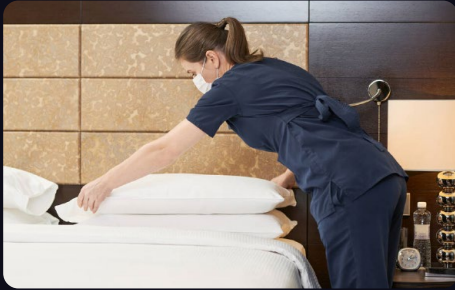
Hotel Personnel Management