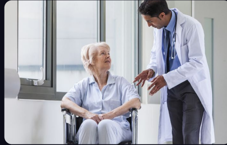
Nursing Home Personnel Management